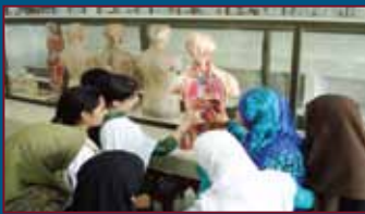
Students at Anatomy Museum