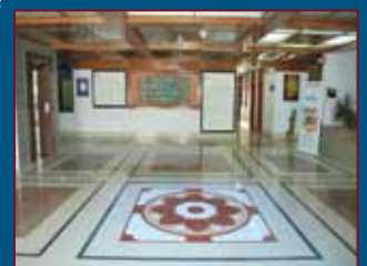
Inside View of DIMC