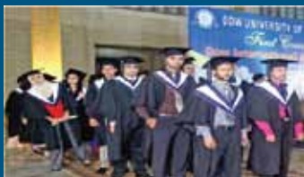
First Convocation (DIMC)