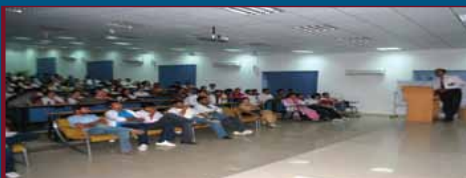
Students attending the Class

THE SKILLS BASED CURRICULUM is according to the current health requirements, and includes proficiency in essential skills like monitoring vital signs, cardiopulmonary resuscitation, common procedural skills, infection control skills as well as communication skills, necessary for all doctors.