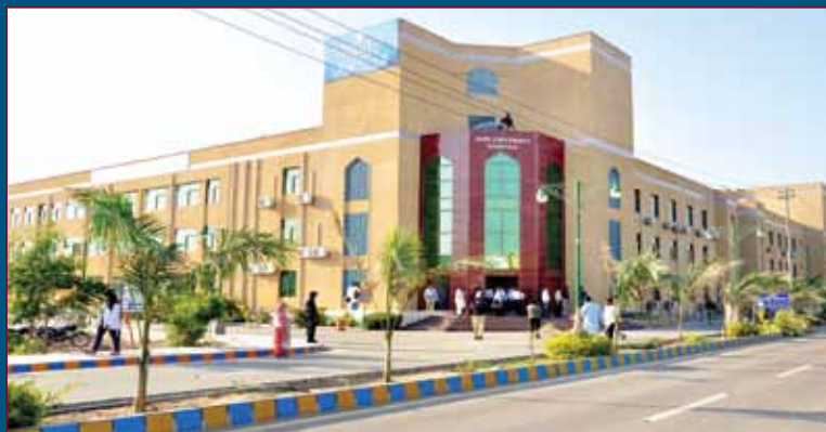
Dow University Hospital

Location Map Dow International Medical College (DIMC) Dow University of Health Sciences (Ojha Campus)