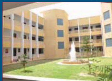
Inside View of DIMC