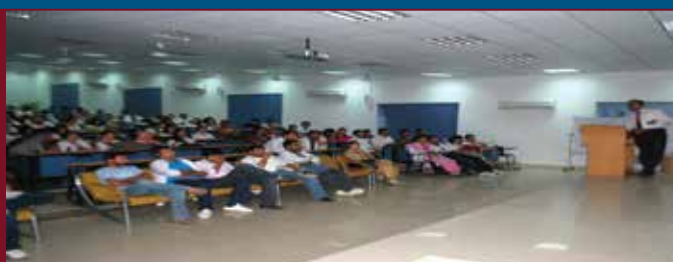
Students attending the Class

THE SKILLS BASED CURRICULUM is according to the current health requirements, and includes proficiency in essential skills like monitoring vital signs, cardiopulmonary resuscitation, common procedural skills, infection control skills as well as communication skills, necessary for all doctors.