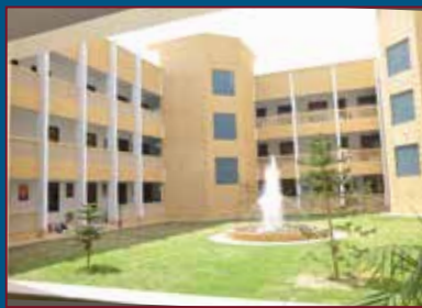
Inside View of DIMC