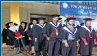
First Convocation (DIMC)