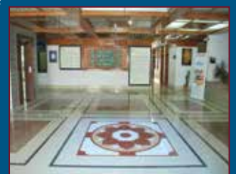
Inside View of DIMC