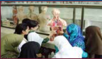
Students at Anatomy Museum