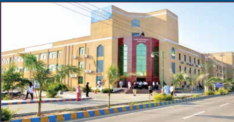
Dow University Hospital

Location Map Dow International Medical College (DIMC) Dow University of Health Sciences (Ojha Campus)