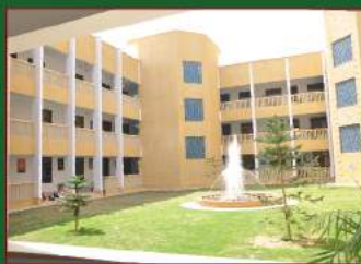
Inside View of DIMC