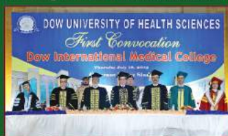
First Convocation of Dow International Medical College