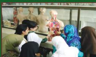
Students at Anatomy Museum

Note: As per eligibility, seats will be allotted on first cum first basis. (for further queries and details please contact on website and emails)