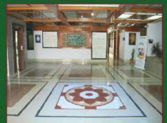
Inside View of DIMC