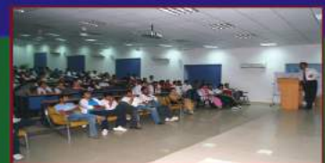
Students attending the Class